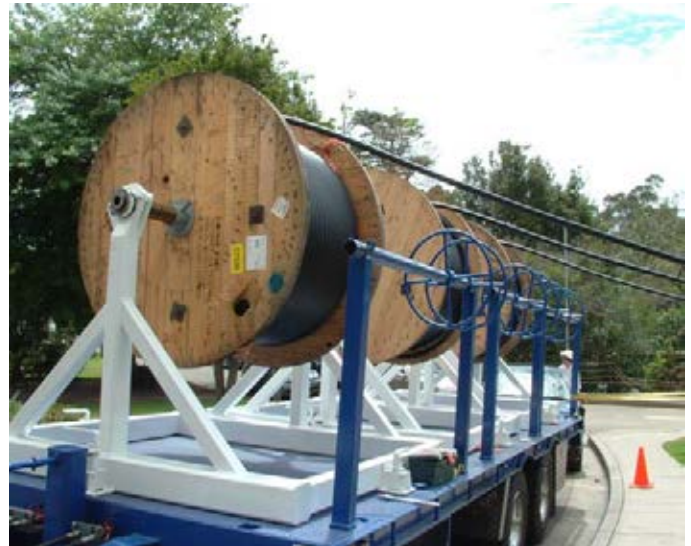
3 x 1core 11kV EPR cables being pulled off the side of the cable

Utilising the All Round Supplies cable truck (Big Blue) along with our new trailer will save time, and with more cable brought to site the hire time could also be reduced saving money.