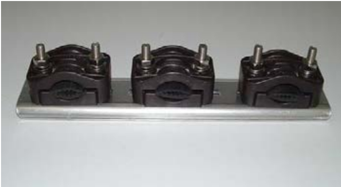
Substation floating cable support clamp (ARS stockcode 03375)

With the release of Integral Energy's new underground distribution construction manual floating cable supports will now be required for some substation terminations. The floating clamp is required where the distance from the crutch of the breakout on the 3 core cable, to the cable supports in the base of the switchgear exceeds 1200mm. The cable clamps are 2 piece plastic clamps and are supplied with nitrile rubber inserts to protect the cable.