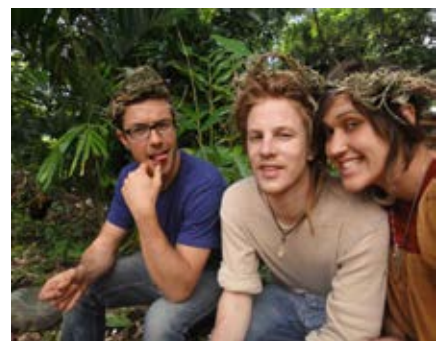
Some photos of the "crew" at work, above Below, How's that for an "office".