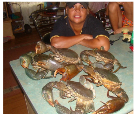
Guess what's for dinner?