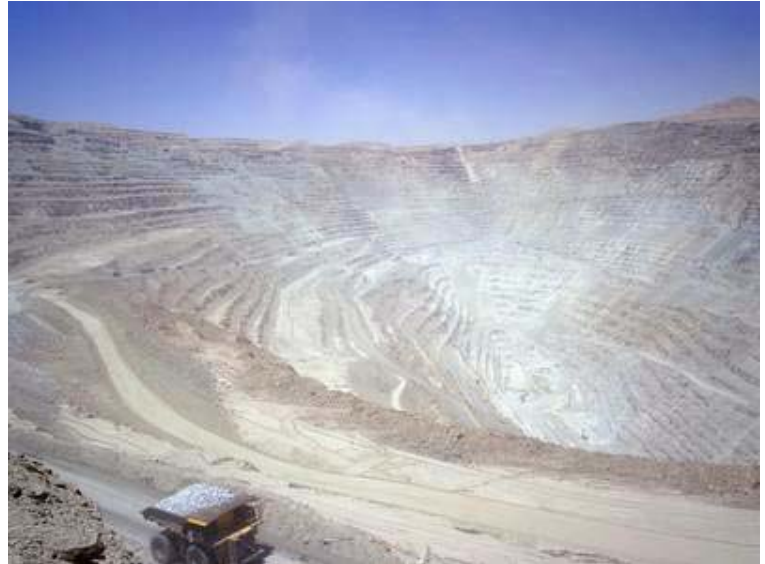
One of the worlds largest open cut copper mines in Chile

The graph below illustrates the rising price copper, values as listed by Australian Electrical and Electronic Manufacturers Association. Wire and cable products account for as much as 75% of copper consumption and the constant rise is being reflected in the increasing price of copper electrical power cables.