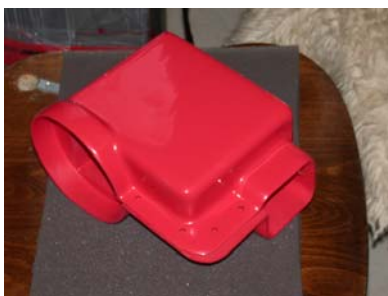
03353 - LV Tx Bushing Cover

The need to use emerclad paint on low voltage ground transformer bushings is no more. Specially designed bushing covers are now available for use in both Integral Energy padmount substations and indoor substations on both 1000kVA and 1500kVA transformers, (a different cover is used for 500kVA transformers). The covers are easy to install, they simply slip over the bushings after the cables have been installed and are secured with cable ties.