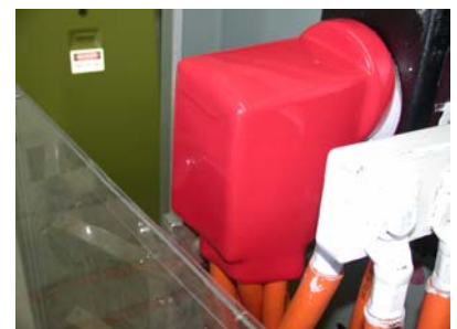
Bushing Cover in lieu of Emerclad

The need to use emerclad paint on low voltage ground transformer bushings is no more. Specially designed bushing covers are now available for use in both Integral Energy padmount substations and indoor substations on both 1000kVA and 1500kVA transformers, (a different cover is used for 500kVA transformers). The covers are easy to install, they simply slip over the bushings after the cables have been installed and are secured with cable ties.