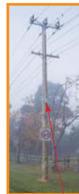
Op handle at approx. 5m above ground