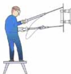
Checking for H.V. fuse failure